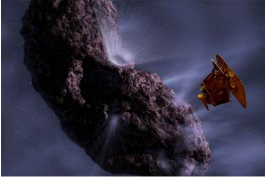
Figure 2: Deep Impact approaching Tempel One