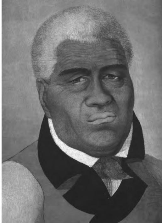
Fig. 21.1 King Kamehameha I, progenitor of the Hawaiian Kingdom, 1795–1819. (Unknown Artist) (Public Domain)

Gonschor writes, “when Kamehameha [learned] of King George and styled his government a ‘kingdom’ on the British model, it was in fact merely a new designation and hybridization of the existing political system,” 9 and the “process of hybridization was further continued by Kamehameha’s sons Liholiho (Kamehameha II) and Kamehameha III throughout the 1820s, 1830s, and 1840s, culminating in the Constitution of 1840.” 10 In 1824, Protestantism became the national religion, and in 1829 Hawaiian authorities took steps to change the name from Sandwich Islands to Hawaiian Islands. 11 The country later came to be known as the Hawaiian Kingdom.