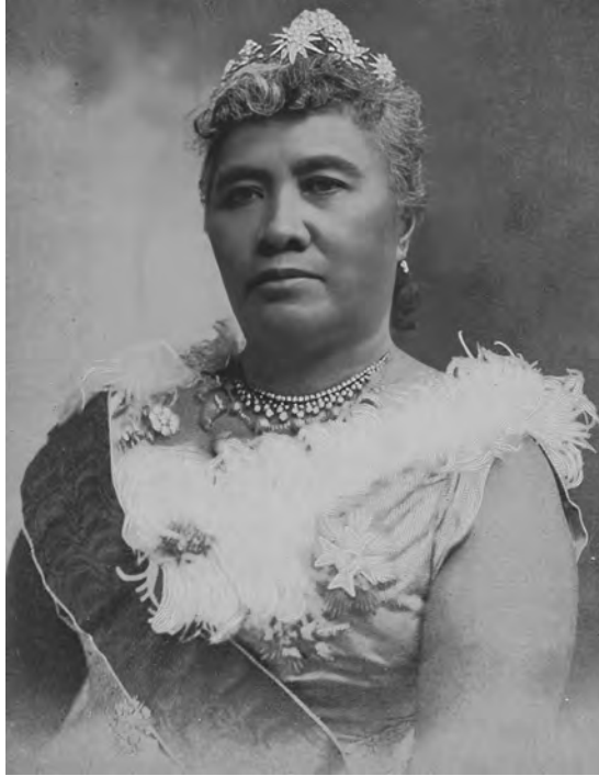
Fig. 21.2 Queen Lili'okalani, Constitutional Executive Monarch, 1891–1917. (Unknown Artist) (Public Domain)

officials and ten persons elected by the corporation's shareholders. According to Henry Whitney: "Native Hawaiians are admitted free of charge, while foreigners pay from seventy-five cents to two dollars a day, according to accommodations and attendance." 53 It wasn't until the mid-twentieth century that the Nordic countries did what the Hawaiian Kingdom had done with universal health care.