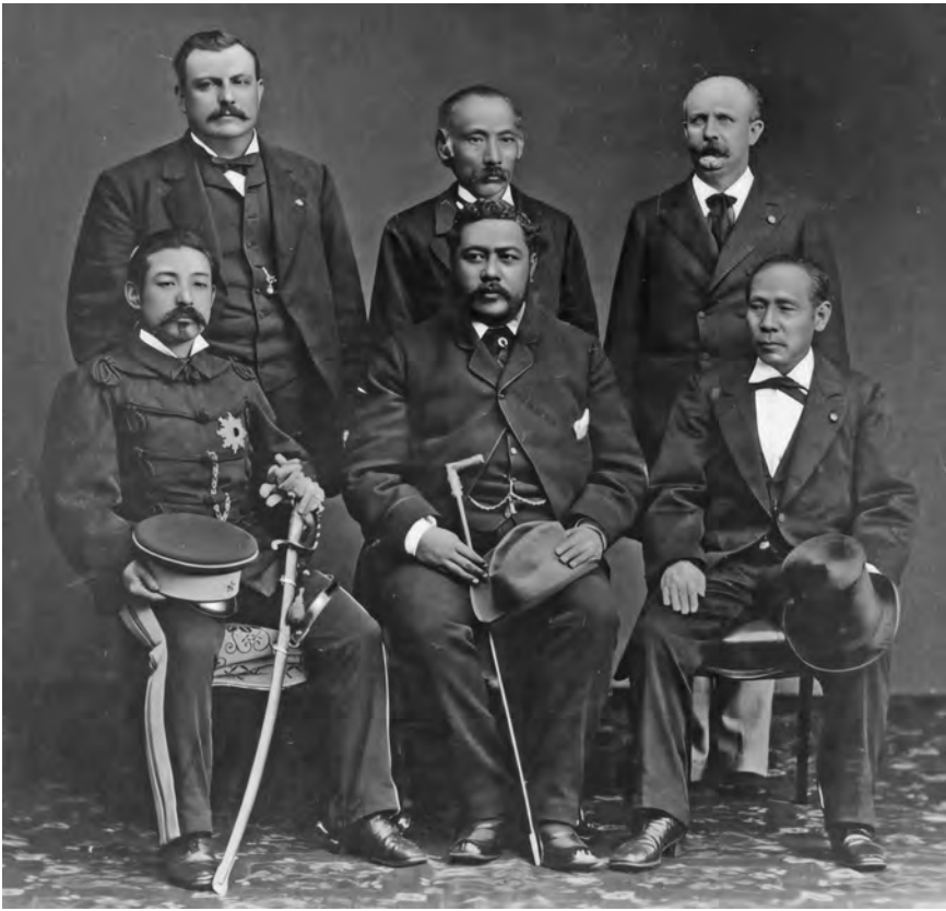
Fig. 21.3 King Kalākaua with officials of the Empire of Japan, 1881. (Top row L–R) Hawaiian Colonel Charles Hastings Judd, Japanese state official Tokunō Ryōsuke, and William N. Armstrong, Kalākaua’s aide; (bottom row L–R) Prince Komatsu Akihito, King Kalākaua, and Japanese Minister of Finance Sano Tsunetami. (Public Domain)

ten months and take the Hawaiian king to Japan, China, Hong Kong, Siam (Thailand), Singapore, Johor (now in Malaysia), India, the Suez Canal, Egypt, Italy, France, Great Britain, Scotland, Belgium, Germany, Austria, Spain, and Portugal (Fig. 21.3). All graciously received the King and he exchanged royal orders with these countries. 60 After he returned home, Kalākaua also exchanged royal orders with Naser al-Din Shah of Persia. 61