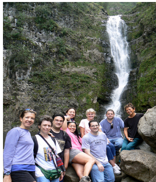
Recreational break during 2007 annual conference on Molokai