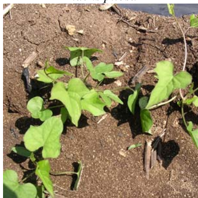
Morning Glory Ipomoea obscura