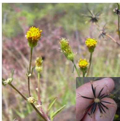
Spanish Needle Bidens pilosa