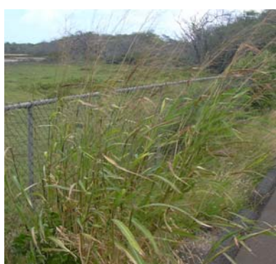
Johnson Grass Sorghum halapense