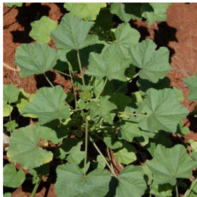
Cheese Weed Malva parviflora