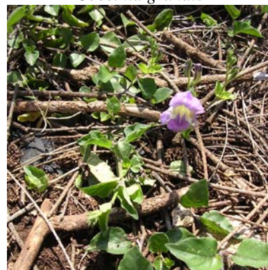
Chinese Violet Asystasia gangetica