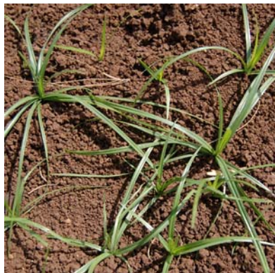
Nut Grass Cyperus rotundus