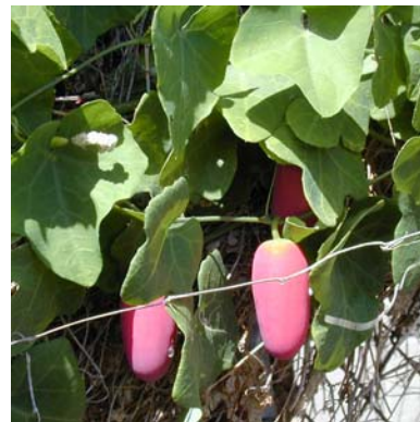
Ivy Gourd Coccinia grandis