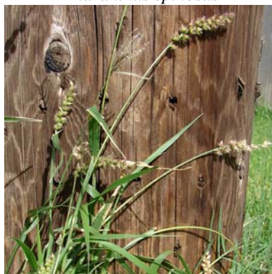
Sandbur Cenchrus echinatus