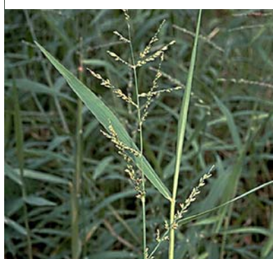
California Grass Brachiaria mutica