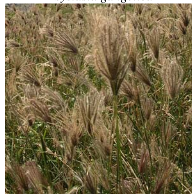
Swollen Finger Grass Chloris barbata