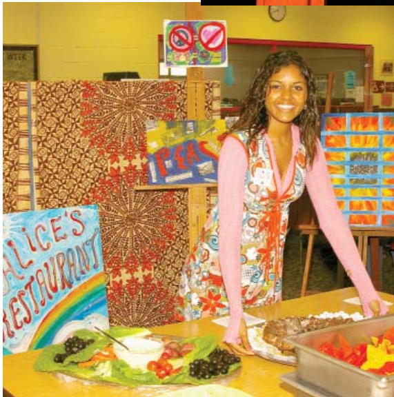
Peace Art Contest