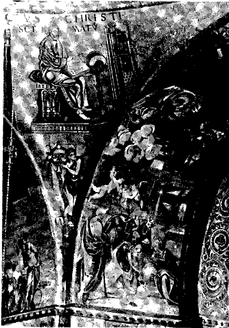
FIGURE 1. One of the four spandrels of St Mark's; seated evangelist above, personification of river below.

The design is so elaborate, harmonious and purposeful that we are tempted to view it as the starting point of any analysis, as the cause in some sense of the surrounding architecture. But this would invert the proper path of analysis. The