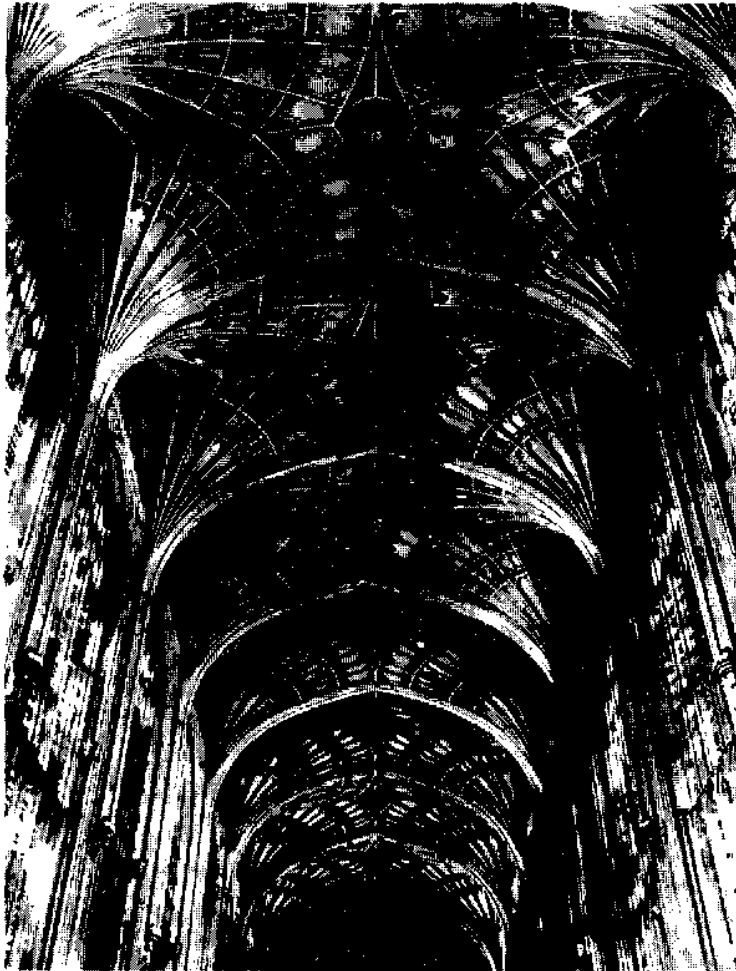
FIGURE 2. The ceiling of King's College Chapel.

the Tudor rose and portcullis. In a sense, this design represents an 'adaptation', but the architectural constraint is clearly primary. The spaces arise as a necessary by-product of fan vaulting; their appropriate use is a secondary effect. Anyone who tried to argue that the structure exists because the alternation of rose and portcullis makes so much sense in a Tudor chapel would be inviting the same ridicule that Voltaire heaped on Dr Pangloss: 'Things cannot be other than they