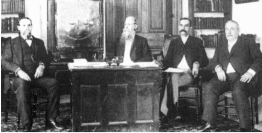
Executive Council of the Provisional Government

overthrown, the sentiment of the people toward existing authority, and, in general, all that can fully enlighten the President touching the subjects of [his] mission (p. 1185).” After arriving in the Hawaiian Islands, he began his investigation on April 1, and by July 17, the fact-finding investigation was complete with a final report. Secretary of State Walter Gresham was receiving periodic reports from Special Commissioner Blount and was preparing a final report to the President.