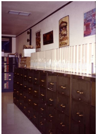
Archives room in the American Theatre Architecture Archives.

The Archives' holdings consist of photographs, negatives, slides, postcards, artists renderings, scrapbooks, books, periodicals, business records, blueprints and architectural drawings, supplier and trade catalogues,