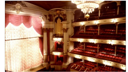
Michael Miller Collection slide PA-MM-19-01-03 Academy of Music, Philadelphia, PA

Michael Miller Collection includes 35mm slides, 3.5x5" photographs, 35mm negatives, and a card catalog index of New York City theatres. The slides and photographs cover the United States, but are primarily New York City and the surrounding area.