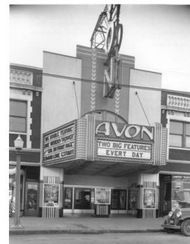
CAPC Neg # S 9871 Avon Theatre, Chicago, IL

includes photographic images taken by the firm for architects and builders. The collection includes approximately 1,400 negatives of 250 theatres mainly in the Midwest. The negatives are 8x10 glass plate negatives, 8x10 film negatives, and 4x5 copy negatives.