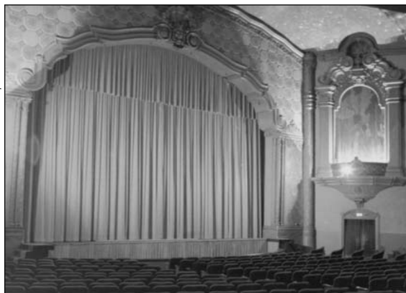
Bob Hope Theatre (Fox). Stockton.

More as we know it at www.historictheatres.org or 630-782-1800