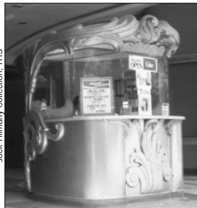
Skouras-ized Box Office. Crest Theatre, Sacramento