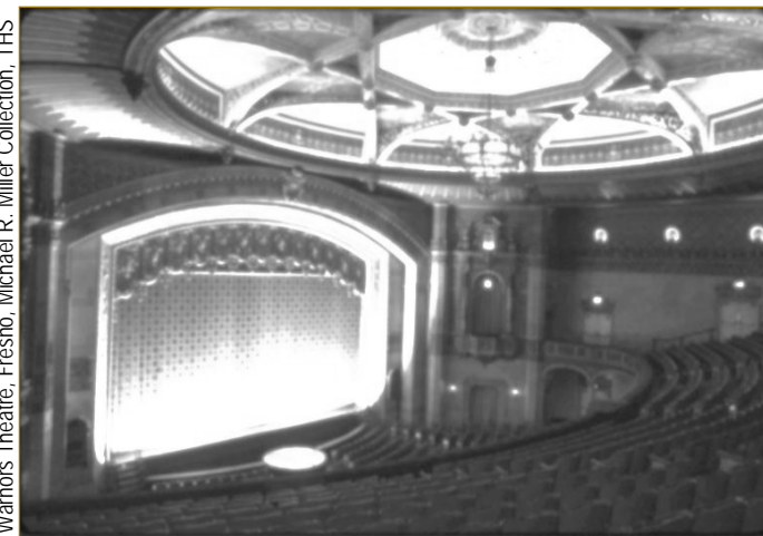
Warnors Theatre, Fresno.