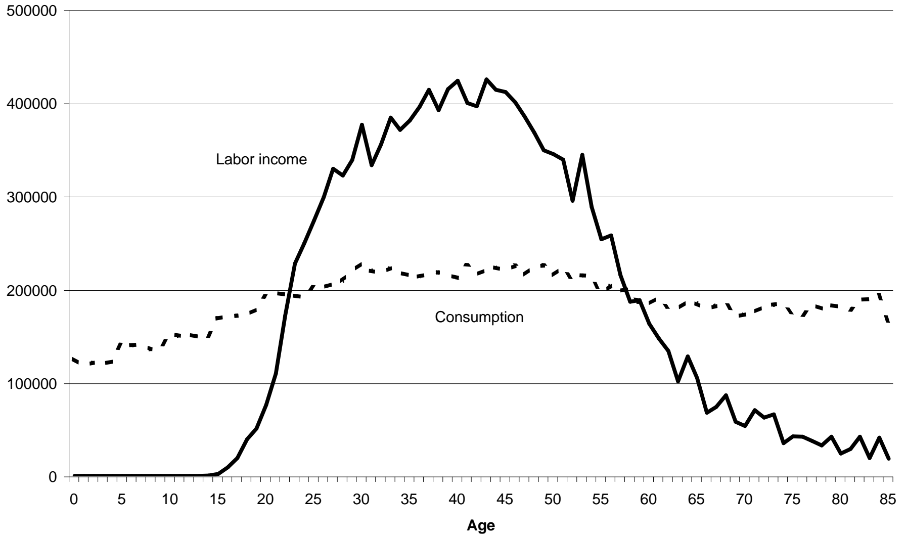
Figure 1. Mean Consumption and Labor Income, Taiwan, 1998 (NT$)